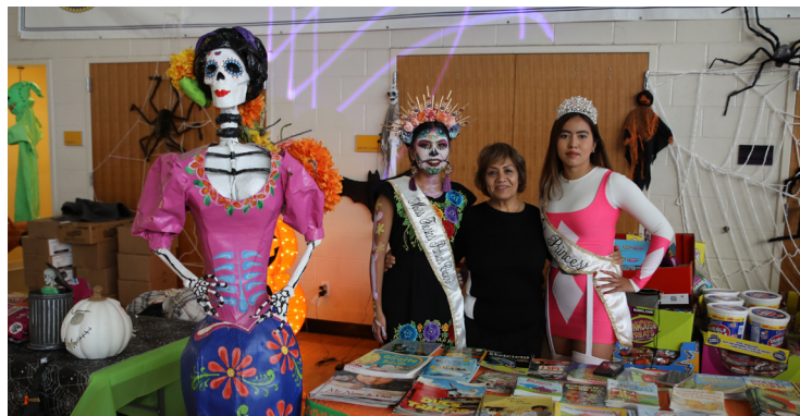
Cicero's Mexican Cultural Committee displays its Día de los Muertos theme at the indoor Trunk-or-Treat celebration.

The Trunk-or-Treat event started as a safe alternative to the traditional Halloween celebration held before the pandemic and has become one of the town's more popular events for kids.