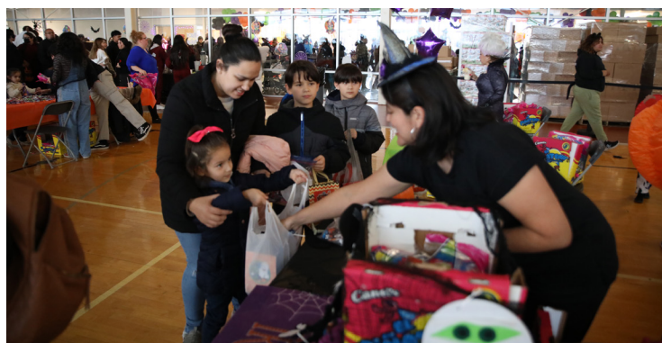
Kids received treats and other gifts throughout the Community Center as the weather brought the fun indoors.