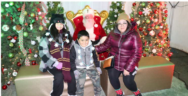
Families enjoyed a special moment with Santa Claus, too!