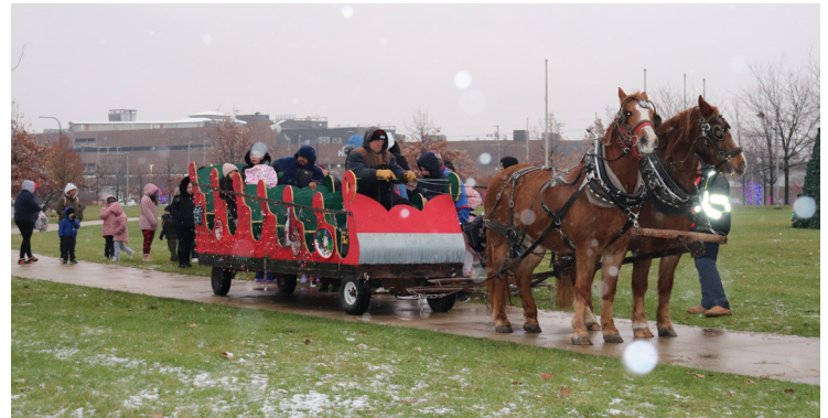
Residents enjoy a sleigh ride through Community Park as the snow falls.