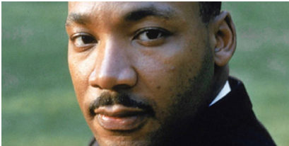
MLK Day African-American Culture

Las obras de arte se pueden dejar en la oficina principal del Centro Comunitario de Cicero y se pueden enviar por correo electrónico a culturalspotlightproject@gmail.com