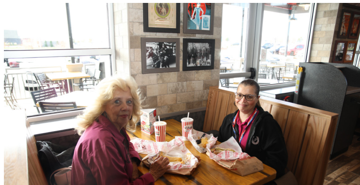
Folks enjoying Portillo's with the walls adorned with Cicero memorabilia.