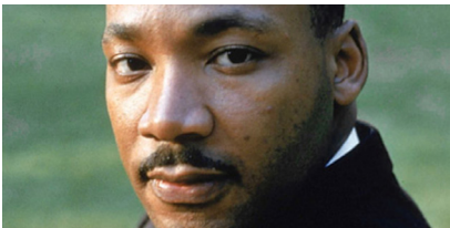
Día de Martin Luther King Cultura Afroamericana