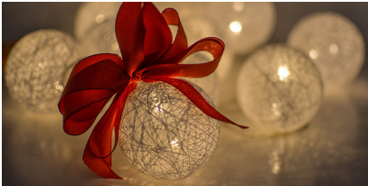
Christmas Around the World

We are asking that Cicero students, kindergarten to grade 12, submit artwork based on a given theme by the end of the month. Please include name, age, school, address and phone number. *Please note: one winner per month and you may only win once per 12-month period.