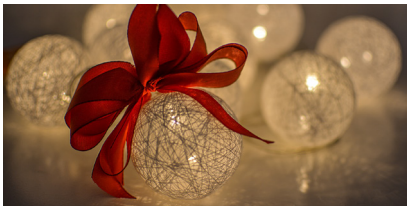
Navidad Alrededor del Mundo

Estamos pidiendo que los estudiantes de Cicero, desde jardín de infantes hasta el grado 12, envíen obras de arte según un tema determinado antes de fin de mes. Incluya nombre, edad, escuela, dirección y número de teléfono. * Tenga en cuenta: un ganador por mes y solo puede ganar una vez por período de 12 meses.