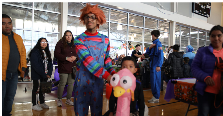
Families dressed up in all the fun as they wandered from table to table, each one decorated by Cicero departments and offices.