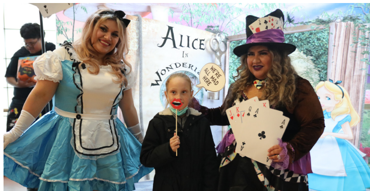
From Mad Hatters to ghosts and action heroes, everyone dressed up to have fun at the annual Trunk-or-Treat event.