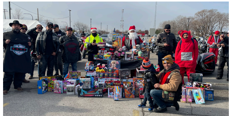
Bikers from the Stainless Machine bike run show some of the many toys they collected for Cicero children at this year's event.

As the Stainless Machine bikers revved their engines for a good cause, they left behind the sound of motorcycles and the resonating warmth of a community united in the spirit of giving.