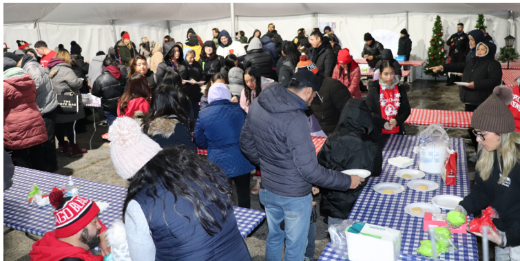
Folks fill the tent to enjoy Christmas treats during the Christmas in the Park event.