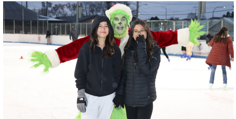
A special Grinch crashes the opening of the Bobby Hull Community Ice Rink.