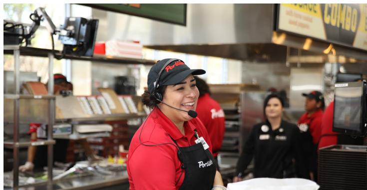
Staff at Portillo's greets residents who joined the restaurant for its first day.