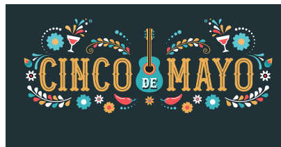
Cinco de Mayo