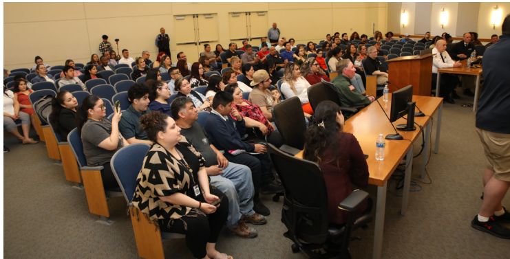
The CERT volunteers await their certificates of completion as the inaugural group of volunteers to complete the program.

Dominick announced plans for future CERT classes, emphasizing the ongoing commitment to community preparedness.