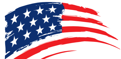
Día de la Bandera