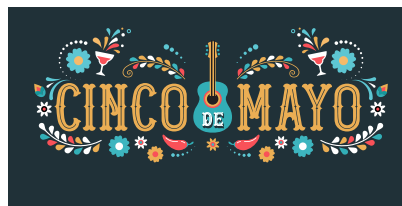
Cinco de Mayo