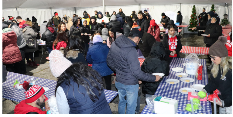
Folks fill the tent to enjoy Christmas treats during the Christmas in the Park event.