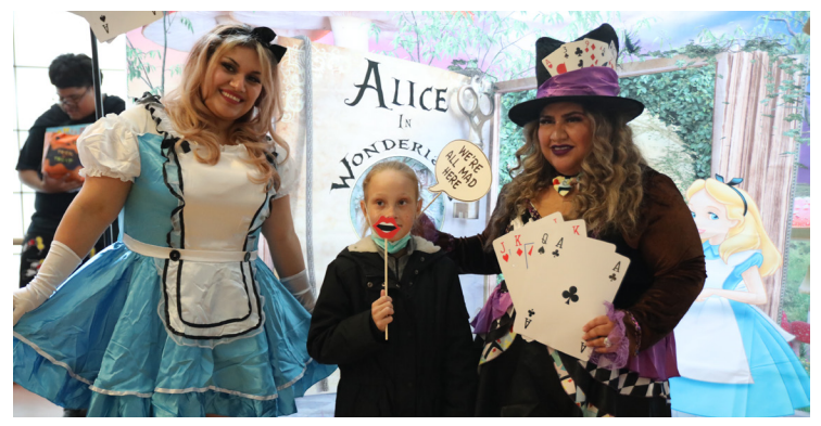
From Mad Hatters to ghosts and action heroes, everyone dressed up to have fun at the annual Trunk-or-Treat event.