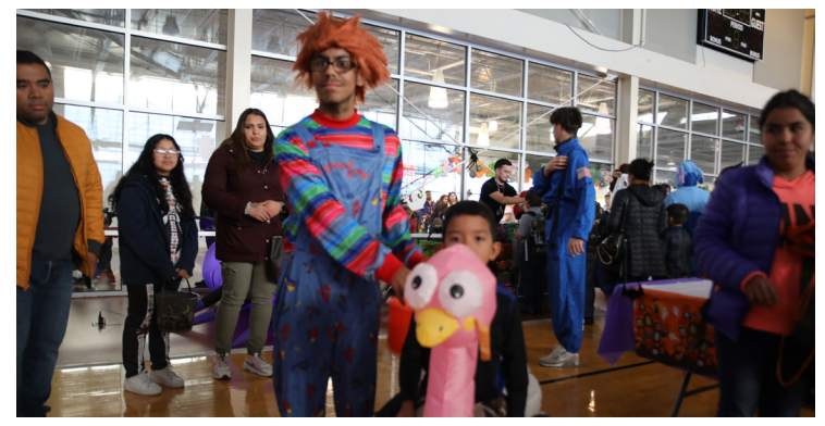
Families dressed up in all the fun as they wandered from table to table, each one decorated by Cicero departments and offices.