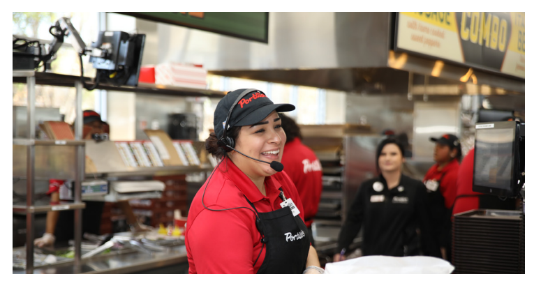
Staff at Portillo's greets residents who joined the restaurant for its first day.