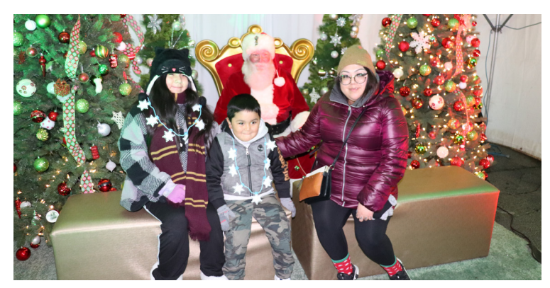
Families enjoyed a special moment with Santa Claus, too!