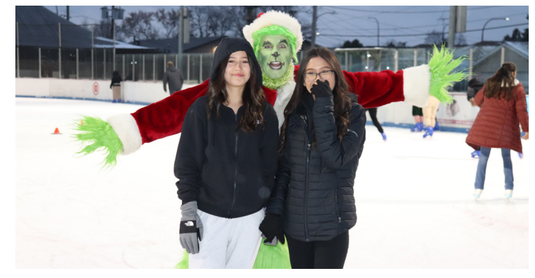
A special Grinch crashes the opening of the Bobby Hull Community Ice Rink.