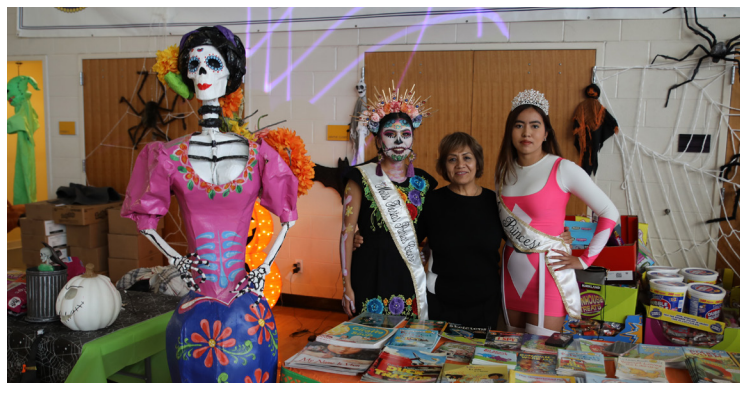
Cicero's Mexican Cultural Committee displays its Día de los Muertos theme at the indoor Trunk-or-Treat celebration.

The Trunk-or-Treat event started as a safe alternative to the traditional Halloween celebration held before the pandemic and has become one of the town's more popular events for kids.