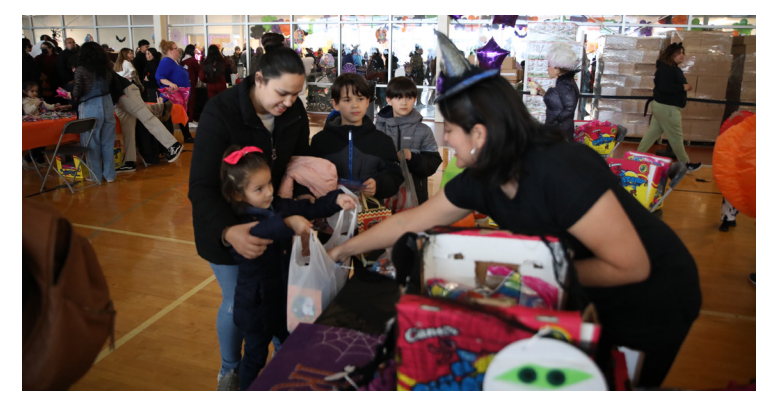
Kids received treats and other gifts throughout the Community Center as the weather brought the fun indoors.