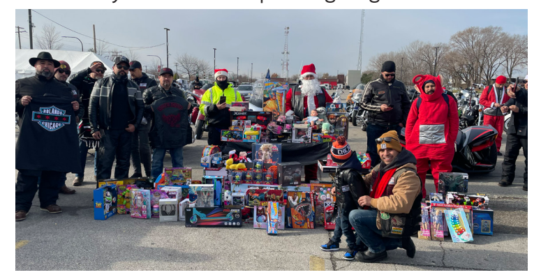
Bikers from the Stainless Machine bike run show some of the many toys they collected for Cicero children at this year's event.

As the Stainless Machine bikers revved their engines for a good cause, they left behind the sound of motorcycles and the resonating warmth of a community united in the spirit of giving.