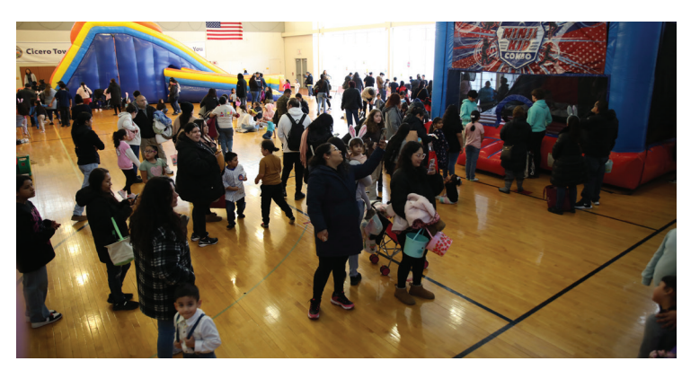
All the same outdoor fun moved into the Community Center because of the area's relentless hold onto winter.