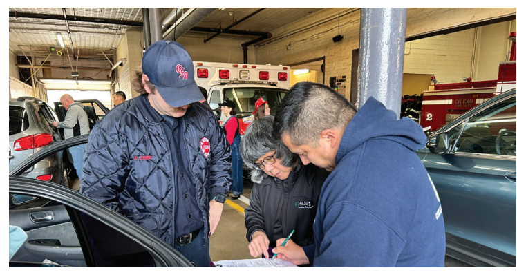
Firefighters run through the check list with instructors from Rush to ensure proper installation with the new techniques.