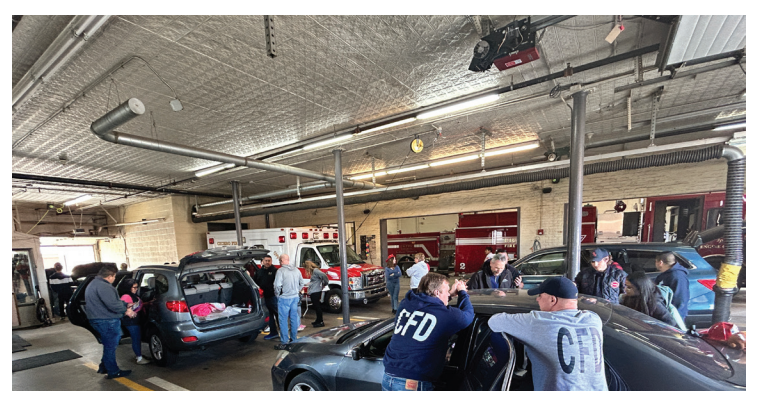
Cars were lined up and pull into the fire station to have child seats properly installed by the Fire Department, one of several services the department provides.