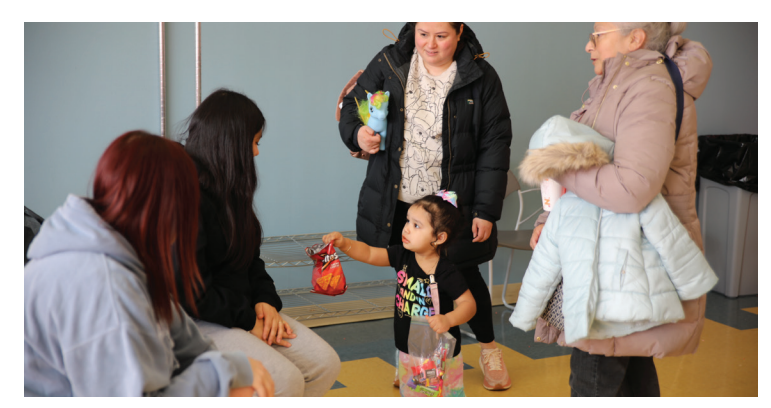
Children enjoyed special treats at the celebration.