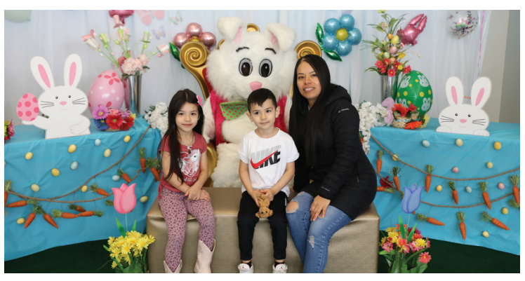
Families had a chance to get their picture taken with the Easter Bunny during the celebration.

Despite weather-related challenges, the Town of Cicero remains steadfast in its commitment to providing memorable experiences for its residents, reinforcing the enduring spirit of community and togetherness.