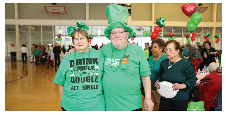
Residents donned their best St. Patrick's gear for the Hearts and Shamrocks celebration at the Cicero Community Center.

Seniors interested in future events are encouraged to contact the Cicero Senior Center at 708-222-8690.