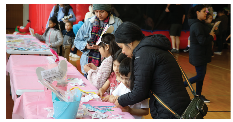
Kids created Easter crafts at the celebration while waiting for a chance to enjoy the bounce houses and get pictures taken with the Easter Bunny.